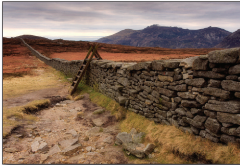
The Mourne Wall, with Slieve Binnian in the distance.