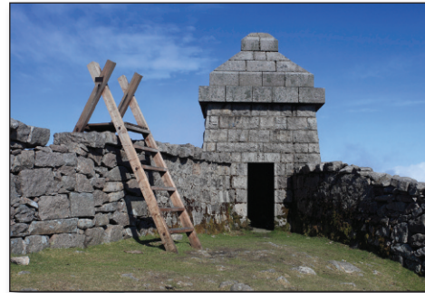
A Belfast Water Commissioner's Tower built in 1921 sits at the summit of Slieve Meelmore.