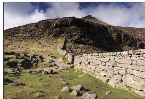
The Hare's Gap, and the Mourne Wall leading up to the summit of Slieve Bearnagh.