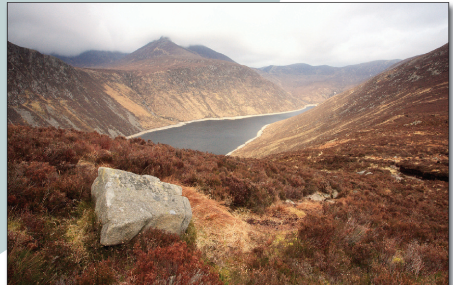
Views looking down on Ben Crom Reservoir.