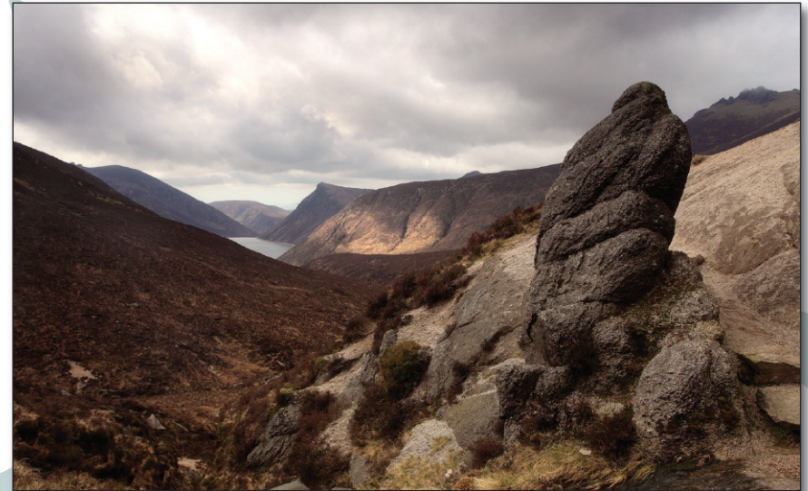
Late evening light along the Brandy Pad.